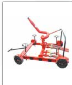
PORTABLE WATER MONITOR TROLLEY