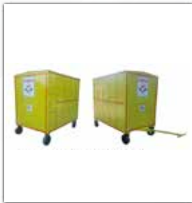
EMERGENCY TROLLEY COVERED AS PER OISD-STD-117