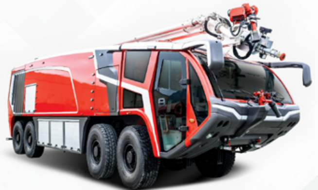
AIRPORT CRASH FIRE TENDER