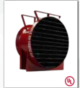
HIGH EXPANSION FOAM GENERATOR UPTO 1000 LPM