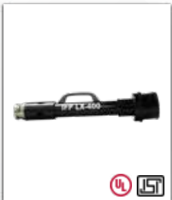
BRANCH PIPE 400 LPM TO 2500 LPM