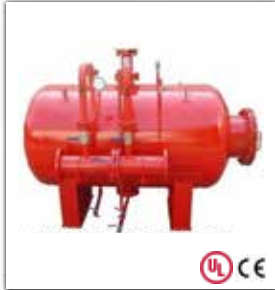
HORIZONTAL BLADDER TANK