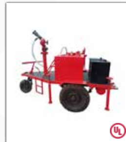
TRAILOR MOUNTED FOAM WATER MONITOR