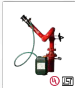
WATER /FOAM MONITOR UPTO 750/1000/2000 GPM