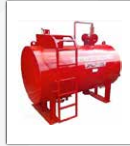
ATMOSPHERIC FOAM TANK