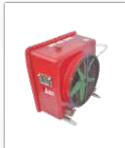
HIGH-EXPANSION FOAM GENERATOR (STANDARD)