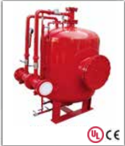
VERTICAL BLADDER TANK