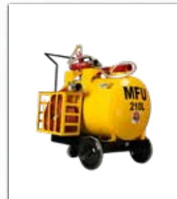
MOBILE FOAM TROLLEY