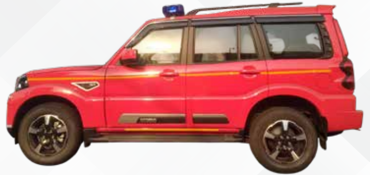
FIRE MASTER JEEP