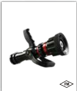
PISTOL GRIP NOZZLE