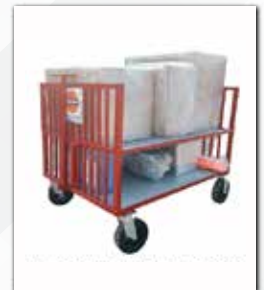
EMERGENCY TROLLEY OPEN AS PER OISD-STD-117