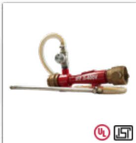
INLINE INDUCTOR 400 LPM TO 2500 LPM