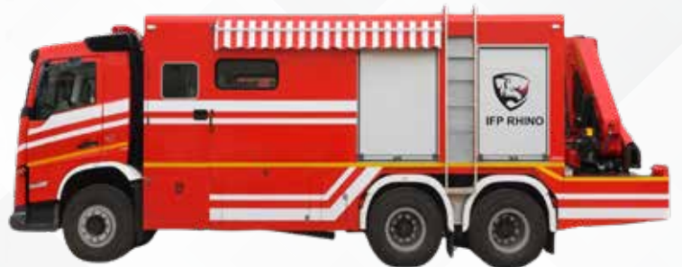
HAZMAT RESCUE TENDER