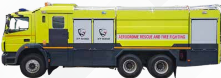
MULTIPURPOSE FIRE TENDER