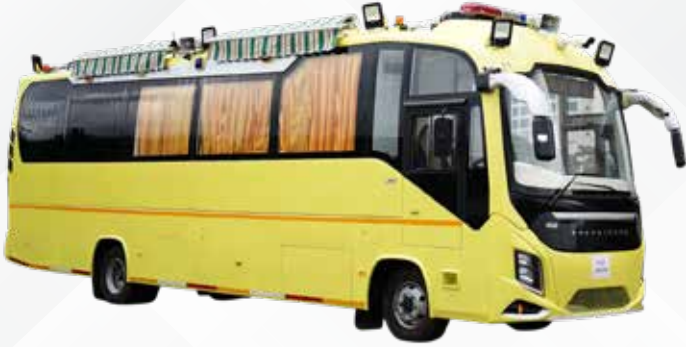
MOBILE COMMAND POST