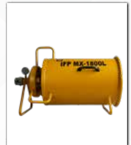
MEDIUM EXPANSION FOAM GENERATOR