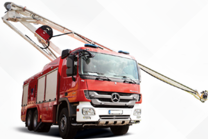
HIGH-REACH EXTENDABLE TURRET